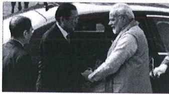
Prime Minister Narendra Modi with his Cambodian counterpart Hun Sen in New Delhi on Saturday

Expressing satisfaction at the current state of bilateral defence ties, including ship visits and training programmes, the two leaders agreed to further enhance the ties, including through exchanges of senior level defence personnel and ca-